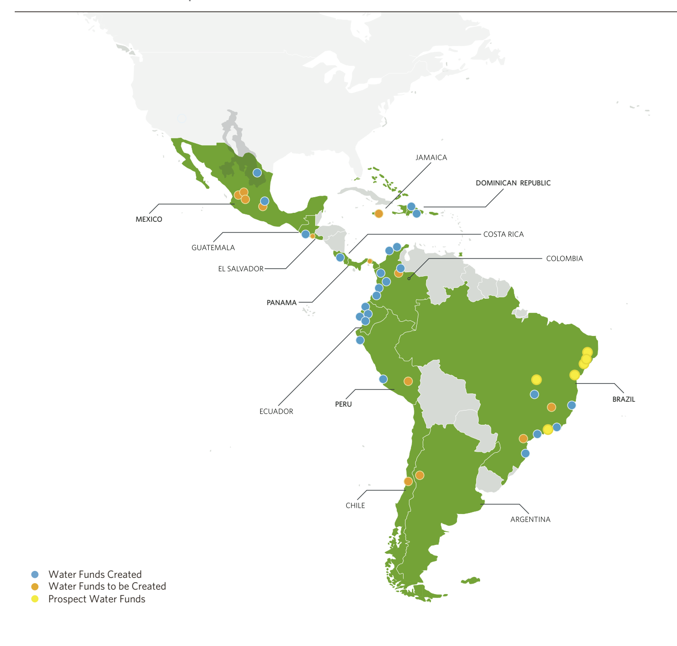
FIGURE 4 Water Funds in Latin America